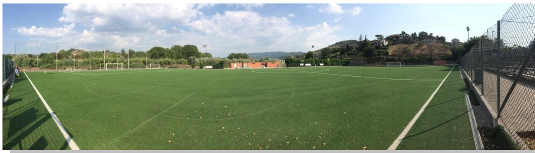
n 4 Competition venues - stadium of Agropoli