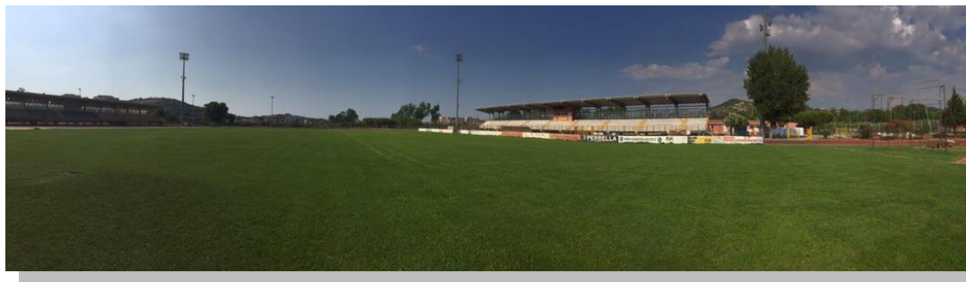
n 3 Competition venues - stadium of Agropoli