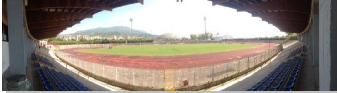
n 1 Competition venues - stadium of Eboli